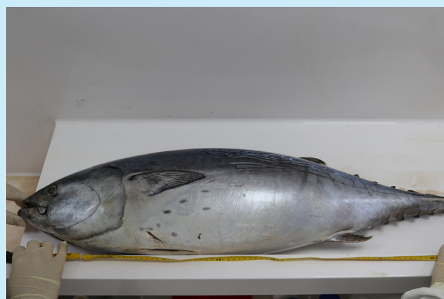
Fish samples processing in the Ecology Laboratory at AquaBioTech Group.

Undertaking market analyses and socio-economic surveys to improve fisheries knowledge and support an evidence-based decision-making process for our clients.