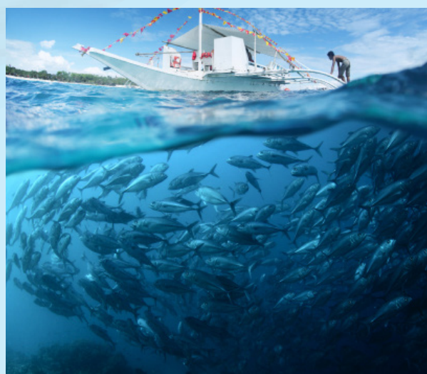
Artisanal fisheries capturing wild stock.

ABT Fisheries provides technical and scientific advice to NGOs, Governmental agencies, and private sector, as well as guidance on the preparation of policy frameworks. Coordinating and facilitating the involvement of multiple stakeholders within consensus-building processes.