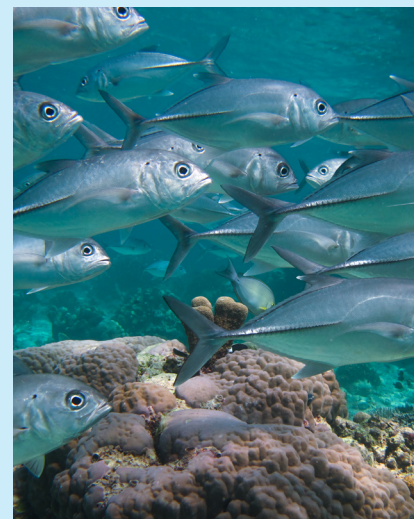
School of fish in the wild.