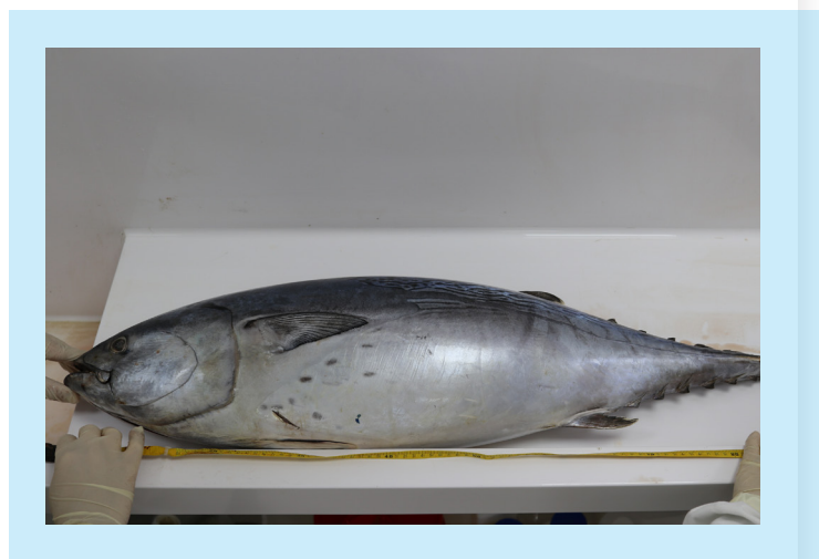
Fish samples processing in the Ecology Laboratory at AquaBioTech Group.

Undertaking market analyses and socio-economic surveys to improve fisheries knowledge and support an evidence-based decision-making process for our clients.